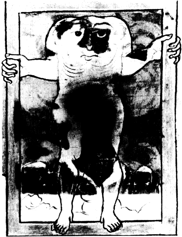
Empiricism: This blemmye from a medieval manuscript on the monstrous races of the East closely resembles Sir Walter Raleigh's secondhand description of the people of Caora. From MS Cotton Tiberius B.v., folio 82a; courtesy of the British Library, London.

the introduction to On the Parts of Animals , particulars occupy the philosopher only as stepping stones to generalizations and the discovery of causes. It is a happy fact that our minds are so constructed as to synthesize universals out of particulars: "Sense perception must be concerned with particulars, whereas knowledge depends on the recognition of the universal." 29 This does not imply that Aristotle's natural philosophy was not empirical, for his natural philosophical treatises reveal him to have been a sharp-eyed and indefatigable observer of an astonishing variety of phenomena. However, Aristotle's experience was common experience, "that which is always or that which is for the most part." 30 Medieval scholasticism was too long-lived and varied a set of doctrines to admit of any monolithic generalization concerning the meaning of experience in natural philosophy; it can nevertheless be cautiously asserted that most observations cited were indeed about what happened always or for the most part, and that these universals of experience served as the axioms for scholastic demonstrations.