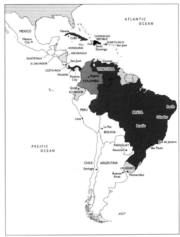
MAP 1. Afro-Latin America, 1800. Credit for all maps: William Nelson