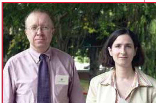
Scott Tremaine and Sara Seager