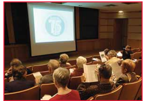
Simulcasts of lectures taking place in Wolfensohn Hall on Founders Day were broadcast in Simonyi Hall