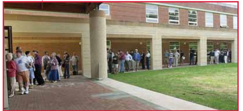
Members of the public waiting to attend Brian Greene's lecture in Wolfensohn Hall.

Columbia University. He is the author of The Elegant Universe (1999), and The Fabric of the Cosmos (2004) and host of the 2003 NOVA program, “The Elegant Universe.” His lecture, “Unification and String Theory,” presumed no background in physics and described Einstein's relentless pursuit of a unified theory of physics, a pursuit that contemporary physicists have taken up in recent decades, pursuing an approach known as superstring theory. Greene presented the discoveries that led to superstring theory, and assessed how close it has come to realizing Einstein's dream. ■