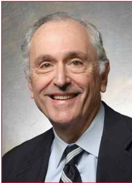
John N. Bahcall

Dr. Bahcall contributed to many areas of astrophysics in addition to neutrino astrophysics, including the interpretation of quasar absorption lines, the study of dark matter in the universe, and the identification of the first neutron star companion. His most lasting influence, however, may be the promising young scientists whom he nurtured, and who went on to successful careers and scientific leadership positions in the academic and scientific community. He created the astronomy group at the Institute for Advanced Study, which became the leading training ground in the country for post-graduate researchers. At the Institute, Professor Bahcall’s daily cry of “Lunch,” from the top of the stairs in the astrophysics section of Bloomberg Hall gathered visiting and member scientists for their daily luncheon. He also helped establish the astronomy groups at the Weizmann Institute and Tel Aviv University of Israel, among others. He