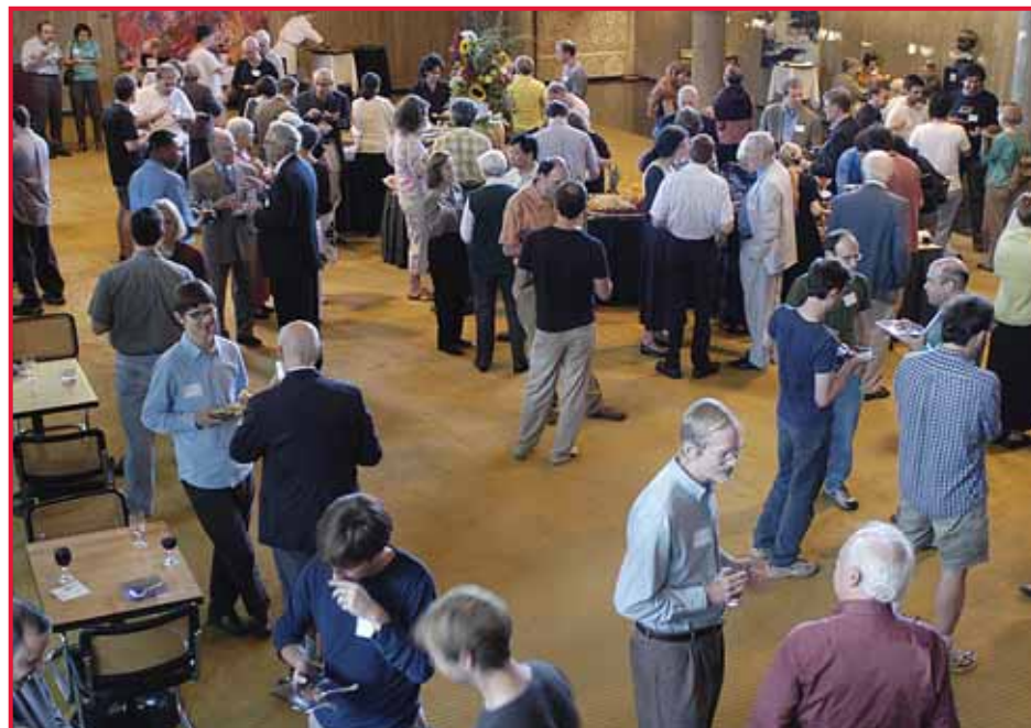
A reception to welcome new Members of the Institute for Advanced Study was held on Wednesday, September 21 in the Institute Dining Hall.