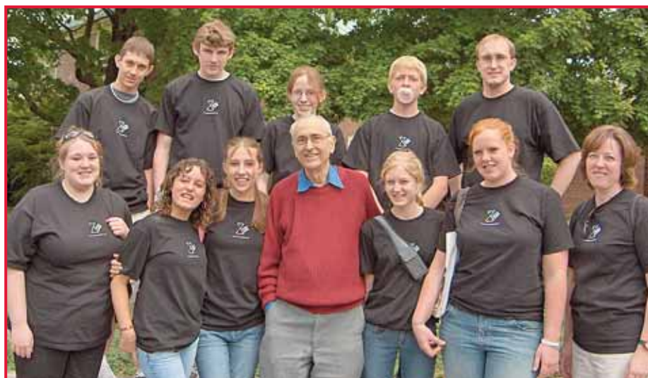
John Bahcall, late Richard Black Professor in the School of Natural Sciences, and a group of high school students from Iowa at the Institute for Advanced Study in May.