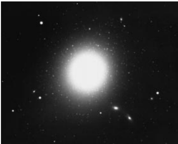
Fig. 1. Two extreme astrophysical many-body problems. Top A binary star, \zeta^1 Ursae Majoris, imaged interferometrically Bottom The galaxy M87. This is not a straightforward N -body problem, as much of the mass is not stellar. Many of the spots of light in the fringes of the galaxy are individual globular clusters