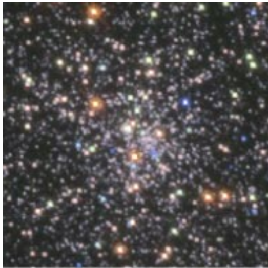
Fig. 2. The central region of the globular cluster M15.

Looking at Fig.2, we cannot immediately tell how such an assembly of stars has got there, or what its fate will be. One might even guess, as Eddington (1926a) once did, that the stars cannot “escape the fate of ultimately condensing into one confused mass”. Nowadays, though many details are unclear, we would argue that the clusters have survived for almost as long as the universe itself, and that they are only now slowly