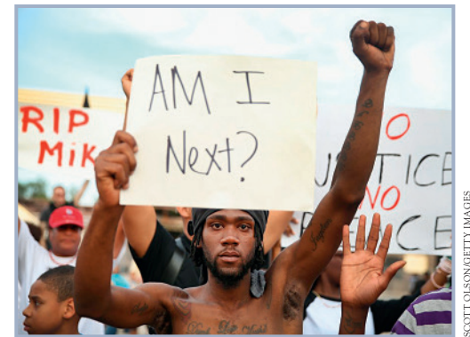
Protesting in Ferguson, Missouri, following the shooting death of teenager Michael Brown in 2014