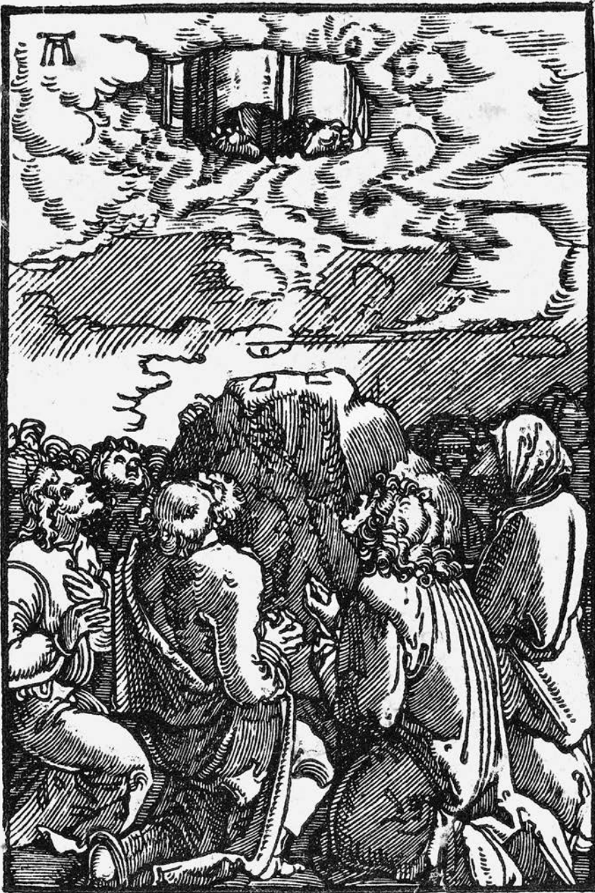
Figure 3. Albrecht Altdorfer, Christ's Ascension, c. 1513, woodcut, the National Gallery of Art, Washington, DC, Rosenwald Collection: 1943.3.362. Although the image depicts ascent, Christ's feet seem to press heavily downward and almost appear as if they are protruding from a column.