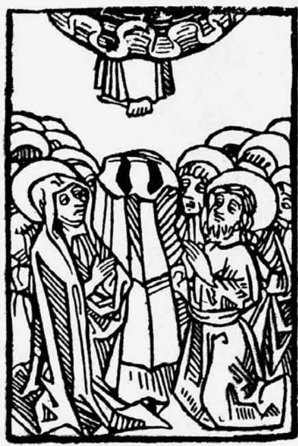
Figure 2. "The Ascension of Christ," from the Horologium devotionis , fol. 92v, woodcut, German, 1489. Some such woodcuts show one footprint and some show two, but all emphasize the space between the departing feet and the footprints that remain. From The Illustrated Bartsch , vol. 87: German Book Illustration Before 1500: Anonymous Artists, 1489–91 , p. 116, #1489/393 [4.2780].

a stone on the Mount of Olives is a manuscript now in the British Library, probably from Trier and produced around 1100. 42 There are a number of twelfth- and thirteenth-century examples of such stones, which sometimes resemble plaques or altars, although many depictions show Christ departing from a hillock or mountain, not a stone. By the mid-twelfth century, we also find illustrations in which Christ leaves behind either one or two footprints, usually directly on a hillock, although there are a few examples that combine the stone and the footprints. 43 In a number of cases, the depiction of Christ as vanishing upward, so that only his feet remain visible, is combined with the presence of the footprints (Fig. 2). 44 (The fifteenth-century woodcut in Fig. 2 is typical of many devotional images from northern Europe.) Although it used to be said that the disappearing Christ and the depiction of footprints appeared together as iconographic motifs, the study of many examples shows that the argument for their coincidence does not completely hold. 45 Nonetheless, the iconographic pairing of traces with disappearance clearly underlines visually the juxtaposition and complementarity of absence and presence, departure and perdurance.