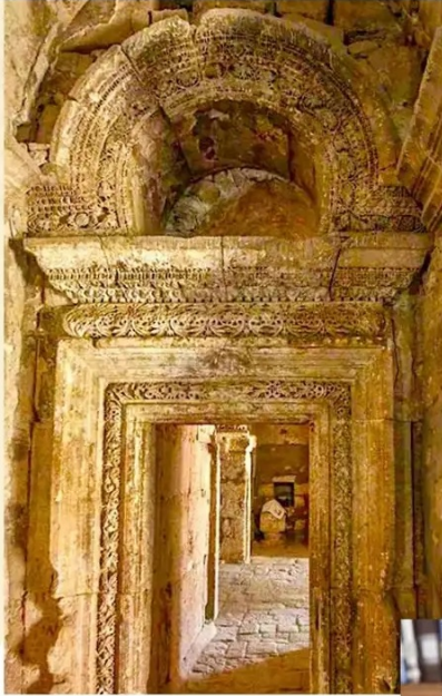
Nisibis, fourth-century baptistry, detail.